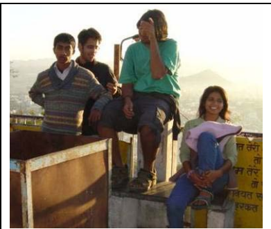
Children performing play at Dastkaar. W & K agency presentation. workshop at Shikshanter, Udaipur .