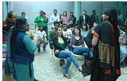
AT CSR Noida