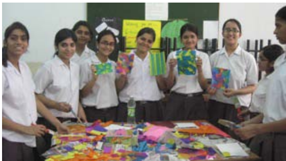
Children of Sardar Patel School

Children from NAZ Foundation came to Karm Marg to celebrate Diwali and new years. They all enjoyed the time and had lots of fun together. This way these children can learn from another about happenings in other places.