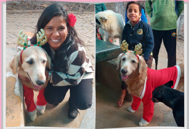
KM Santa claus